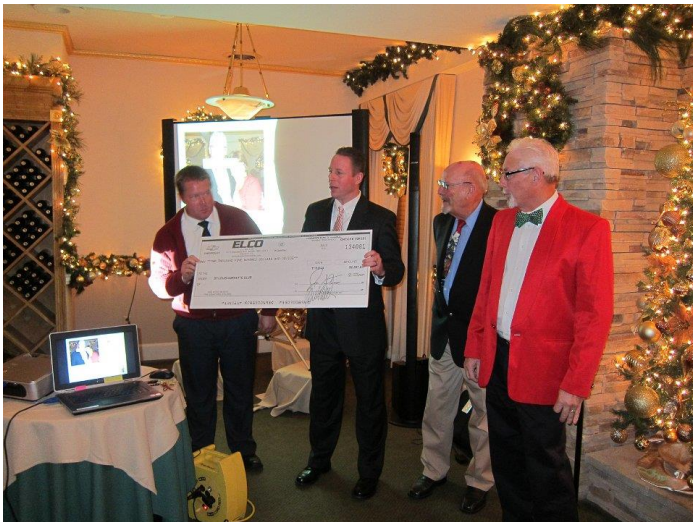
Thanks to Elco Chevrolet for sponsoring our club!