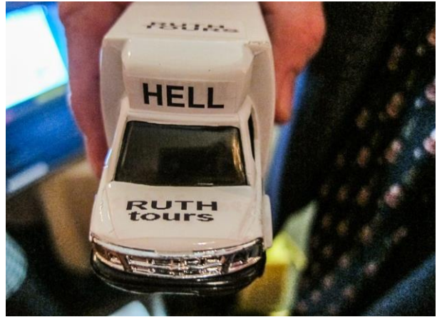
If you witnessed Ruth's slide show then there is no need to explain this picture.